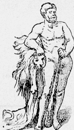
HEALTH, STRENGTH & ENERGY.

Directions for Self-Treatment of the above diseases with each Bottle.